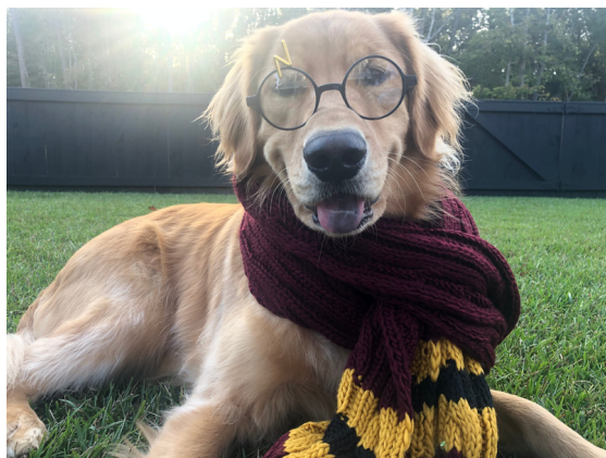
Click here for more information.

"You can't stop the waves, but you can learn to swim."